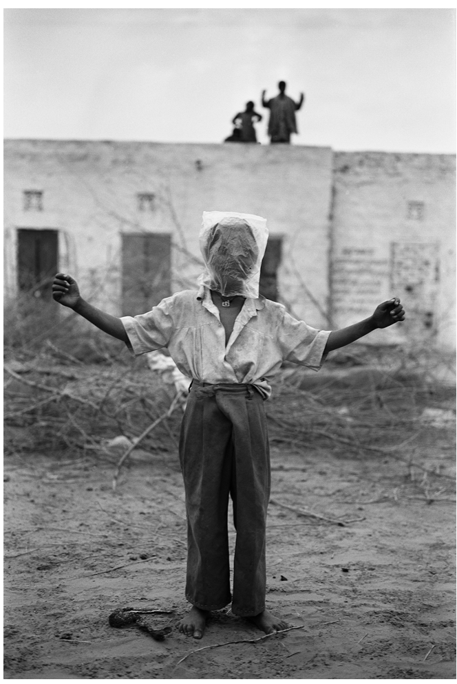
Gauri Gill. "Jogiyon ka Dera, Lunkaransar" from "Notes from the Desert" (1999-ongoing), © Gauri Gill (all images courtesy of the artist unless otherwise noted)