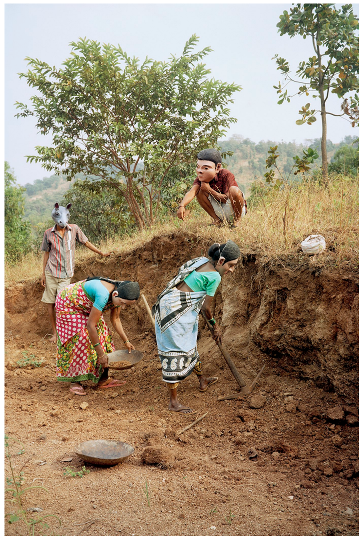
Gauri Gill, "Untitled" from "Acts of Appearance" (2015-ongoing), © Gauri Gill

Another photograph nearby depicts four masked characters. A Donkey Man leans against a dirt mound, his left arm outstretched, angling up his left shoulder, while another masked figure with an inscrutable expression squats on top of the mound, a hand gesturing towards a pair of women below. This apparently anecdotal scene is an implication of the National Rural Employment Guarantee Act, a government scheme intended to provide wages for work to the rural poor. In this context, we read the actor seeming to hover on high as a contractor or government agent, a symbol of class exploitation — an interpretation corroborated by the presence of the Donkey Man. In practice, in Indian society, those on the lowest social rung, like the Adivasis, are accorded less value than beasts. It's a sharp critique of a system that has beenbuilt on the edifice of economic slavery.